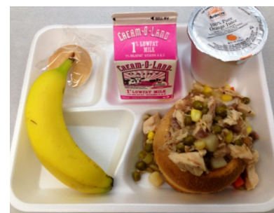
Turkey Pot Pie in a bread bowl is a great way to balance grains, protein & veggies in one!