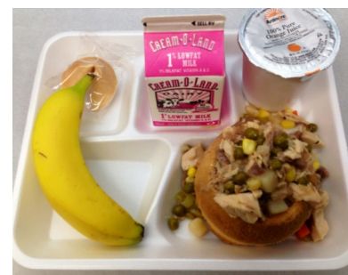
Turkey Pot Pie in a bread bowl is a great way to balance grains, protein & veggies in one!