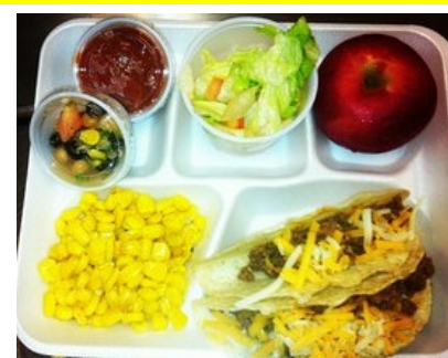
Taco Twins are easy-to-eat and an excellent source of iron for our growing customers!