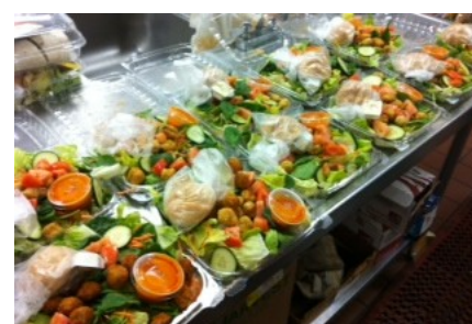
Buffalo Chicken Salads are popular across the board!